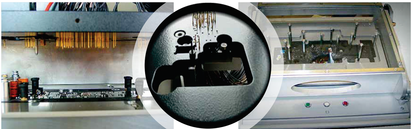
Exchangeable contact unit and VPC interface for multiple test scenarios, left HFT in-line, right laboratory test device for functional test / HFT